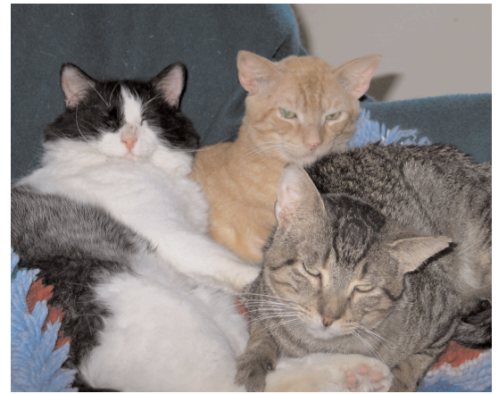
Ralston, Ashley & Waldorf—sleek & happy, always together like a close family.