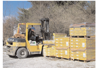
Unloading cases of donated food.