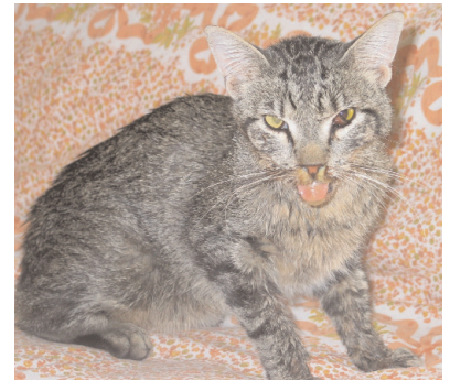
Tigger after his first surgery.