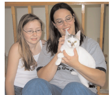
Fauna was a very sweet Katrina rescue cat who joined this family.