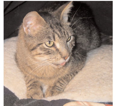
The final outcome – looking and feeling so much better!!