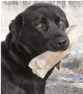
Bowser finally has a life.