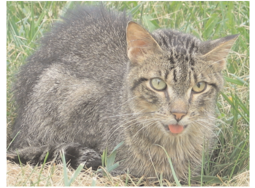
Tigger looks better here, but still cannot close his mouth because his jaw is wired up and hurts him.