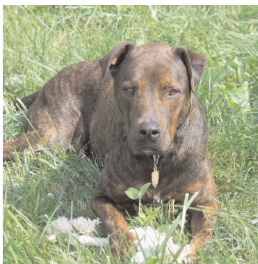
Chance, a Katrina rescue was one of our most well behaved dogs.

In early Spring three more Katrina dogs came to the sanctuary, however this time they were from other rescuers.