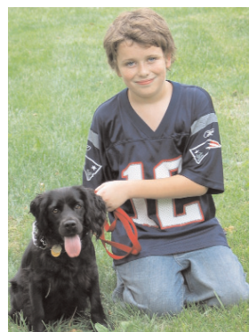
A once abandoned Sophie finds her forever home.