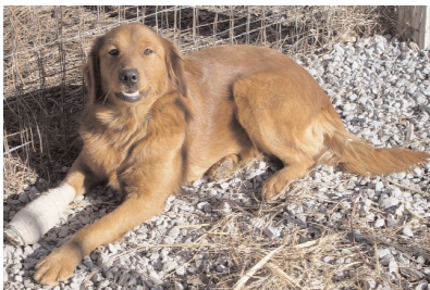
Chelsea's foot was badly injured in a trap.