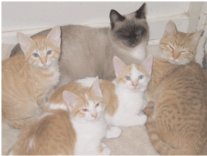
Always lots of kittens!!