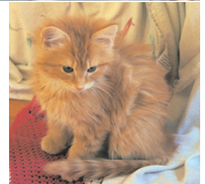
More rescued kittens!