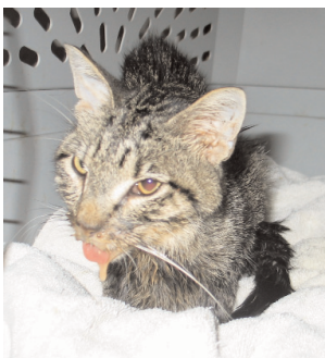
Two days later, emaciated barely hanging on to life.

days and bad days." When Tigger started eating it was with a gusto that did not quit. "He was hungry all the time, and we had to pace him and feed him small amounts at first because he was still on a very restricted diet ." The intensive care continued for over a month and during that time, Tigger still had his jaw wired up which was pretty uncomfortable for him. The fracture had not healed properly and he could not close his mouth, so he just sat there with his tongue hanging out all the time, drooling.