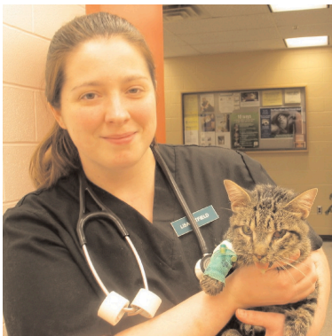
Tigger entering Iowa State Veterinary Hospital.