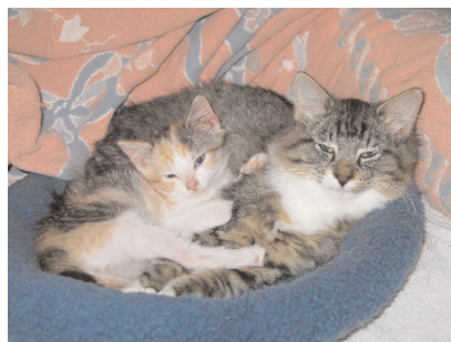
Kaboodle & Sophie got to stay together in their new home.