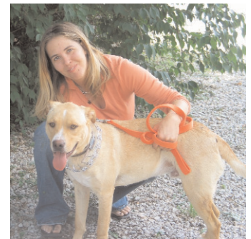
Nugget is a Katrina rescue from New Orleans looking for a home.