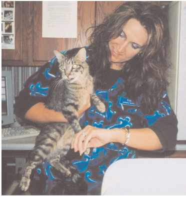
Tigger with a veterinary assistant.